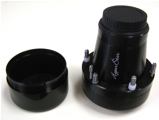
Secondary holder (shipped attached to lens) & HyperStar lens