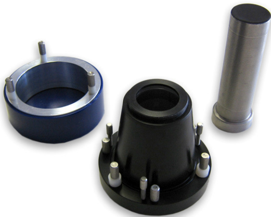
Secondary holder, HyperStar lens, and counterweight